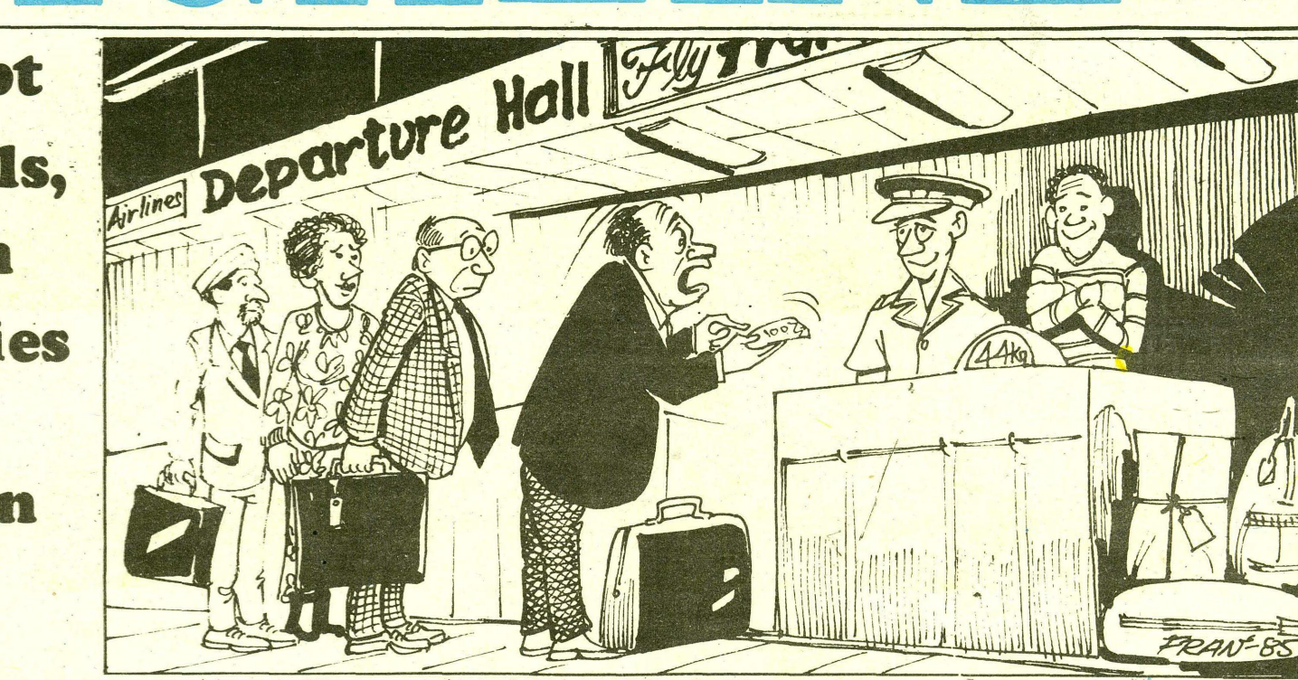
"Look man, this is all I have between me and starvation. If you insist on "chai" why don't I buy you a cup at the cafeteria.