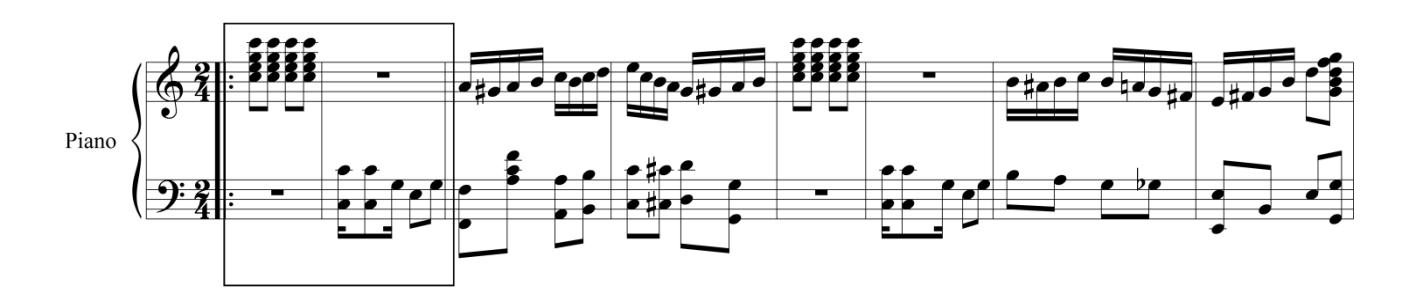
Example 2. Fate Marable & Clarence Williams, "Barrel House Rag", score, New Orleans, Williams & Piron Music Publishers Company, ©1916, measures 5-12. The first two transposed measures match those considered to be homologous of 1a

This two-measure suggestion whose origins, according to La Rocca, may be led back to a tango, is textually integrated as an incipit of "Barrel House Rag"s first theme, printed by Fate Marable & Clarence Williams on November 9<sup>th</sup>, 1916<sup>42</sup> (cf. Ex. 2), bearing witness to broad circulation (see below , however, for an alternative interpretation).