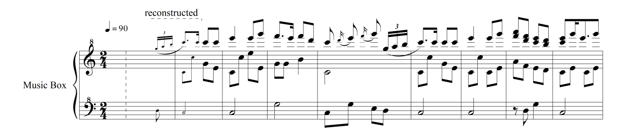
Example 3. Anonymous piece of the 1867 music box, New Orleans, in Al Rose (ed.), Played with Immense Success, Pirogue Race Records LP, no serial number provided, 1979 (Transcription by V. Caporaletti, first eight measures; the actual sounds are raised approximately up to a semitone)

multiple attack acciaccatura of the two half-phrases, and the motivic cell with the four notes on the tonic in the first and fifth measures. Despite the absence of the motif corresponding to the "get over dirty" motto, this composition may be considered one of the forerunners of the traveling motifs so widespread in Crescent City at the end of the 19th century, especially in view of the aural approach enabled by the mechanically plucked idiophone, the medium of the music box.