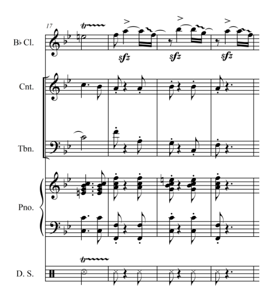
Example 4. ODJB, "Tiger Rag", New York, March 25th, 1918. Beginning of sub-section 1b, meas. 17-20 (Transcription by V. Caporaletti, concert pitch)