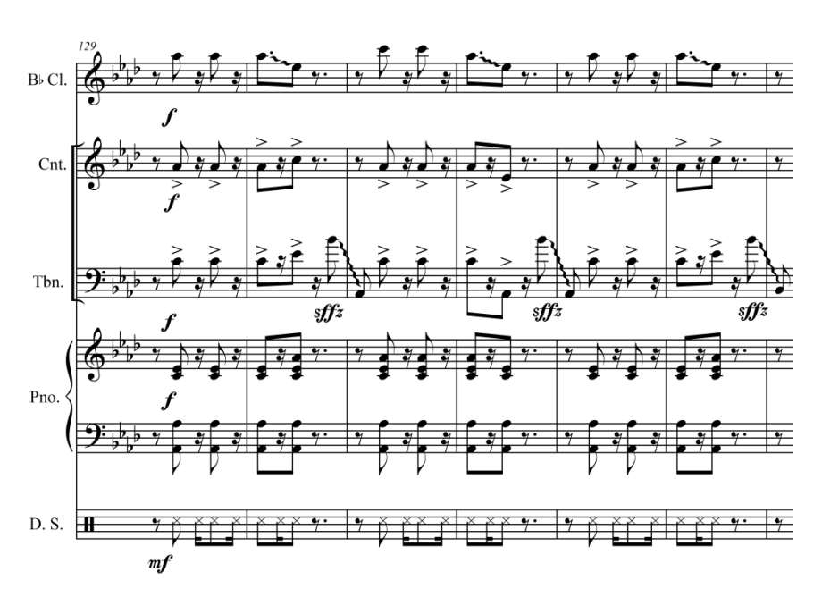
Example 13. ODJB, "Tiger Rag", New York, March 25th, 1918, beginning of section 3z. (Transcription by V. Caporaletti, concert pitch)

• in section 3z, the syncopation in this ostinato formula, setting up the famous tiger growl by way of an answer and interpolation, with the descending trombone glissando ; there is, in fact, an iterative crescendo all through section 3y, gathering energy flowing into the 3z's final syncopated section echoed by the growl imitation (Ex. 13).