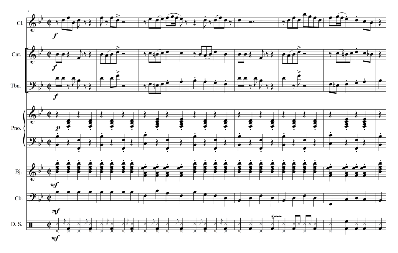
Example 10. <u>Kid Ory's Creole Jazz Band, "Get Out Of Here (And Go on Home)", Los Angeles, August 3rd, 1944. Subsection 1a (meas. 1-8)</u> (Transcription by V. Caporaletti, concert pitch)

It is worth noting how, in the New Orleans musicians' semantic system (the insiders' perception, that is), harmonic-formal structures 1a , 1b and 3 , with their related tonal relationships, are specific factors of "Number Two" whereas 1a and the metrically compressed section 3 may be, in comparable ways, the constituent elements of "Get Out of Here". The fundamental distinctive trait is therefore 1b whose presence/absence marks changes in the unit of musical conceptualization<sup>84</sup>, with, it would seem, the composition's character done by the livelier tempo in "Get Out of Here" as opposed to the considerably more restrained one in "Number Two" (cf. Tab. 4).