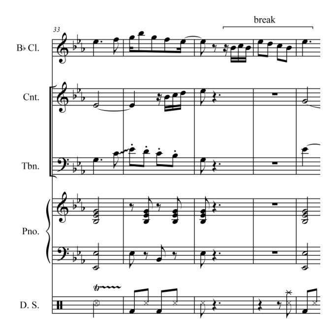
Example 7. ODJB, "Tiger Rag", New York, March 25th, 1918. Beginning of sub-section 2a, meas. 33-36 (Transcription by V. Caporaletti, concert pitch)

Secondly, after the two breaks in "Tiger Rag" (and the two answers from the woodwinds in the "March"), an analogous reactive textural "animation" stands out in both pieces, suggesting strict sensori-motor homologies between sub-section 2a and the "March"s first theme.