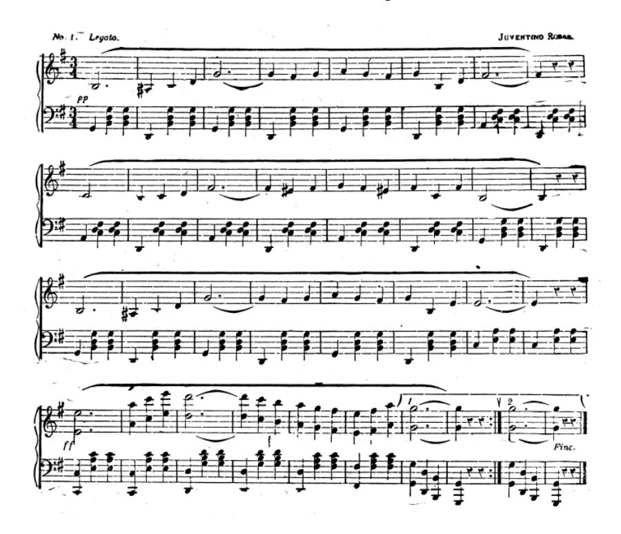
Example 9. "Sobre Las Olas", by Juventino Rosas. First section

Let us now consider the second case, in terms of which the word "part" would correspond, for Weber, to the formal 32-measure structure thus including section 3 along with the AABA unit (first strain) based on 1a and 1b. The latter thesis would seriously undermine La Rocca's position while the "National Emblem March hypothesis", one of "Tiger Rag"s principal formal/harmonic archetypes which, at this point, would be matching the archaic "Number Two", would have to be dated back to before 1906. In that case, DeDroit would have actually proposed an ancient example of New Orleans oral tradition. Contextually, Stewart's and Baudoin's hypothesis regarding the genetic ascendant "Sobre las Olas" (Ex. 9) would gain credibility, as already noted, a composition published in 1888 by Mexican composer Juventino Rosas, whose first reception in Crescent City, however, goes as far back as December 16<sup>th</sup>, 1884 when the VIII Mexican Chivalry Band officially performed it, with Rosas himself conducting, at the New Orleans World's Industrial and Cotton Centennial Exposition<sup>72</sup>.