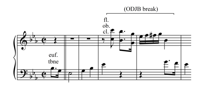
Example 6. Reduction of the quote from "The Star-Spangled Banner" in "National Emblem March", meas. 11-14 (concert pitch; 2/2 meter is rendered in 2/4 in order to facilitate comparisons with the homologous passage in "Tiger Rag" in Ex. 7). The section with markings is the one which the ODJB transformed into a break