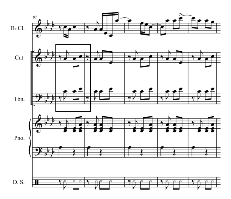
Example 12. ODJB, "Tiger Rag", New York, March 25th, 1918, beginning of section 3y. The rhythmic-melodic cell called hone-ya-da is emphasized in the square box. (Transcription by V. Caporaletti, concert pitch)

• in section 3z, the syncopation in this ostinato formula, setting up the famous tiger growl by way of an answer and interpolation, with the descending trombone glissando ; there is, in fact, an iterative crescendo all through section 3y, gathering energy flowing into the 3z's final syncopated section echoed by the growl imitation (Ex. 13).