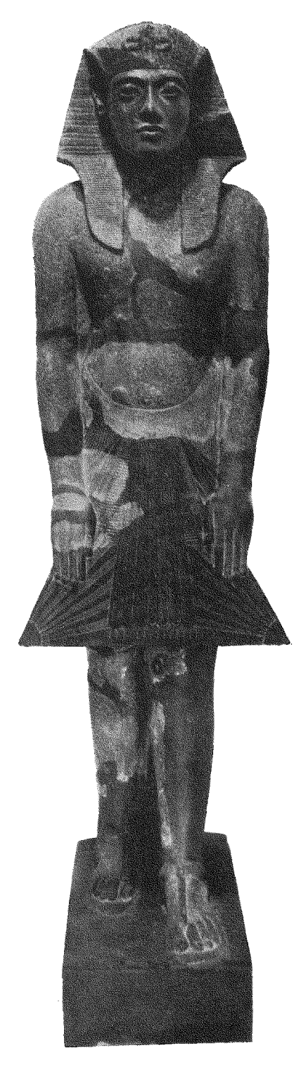
1.—Reconstructed statue of Tut'ankhamun. Height 1 m. 57. Journal d'entrée, no. 66757.