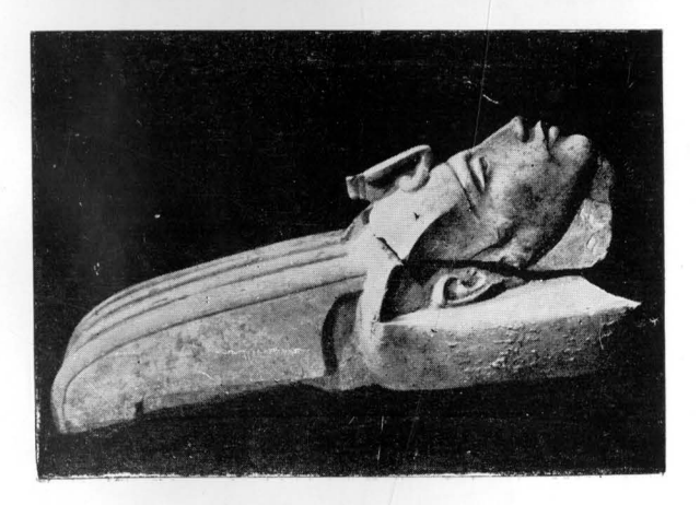
The Four-feathered Crown of Akhenaten