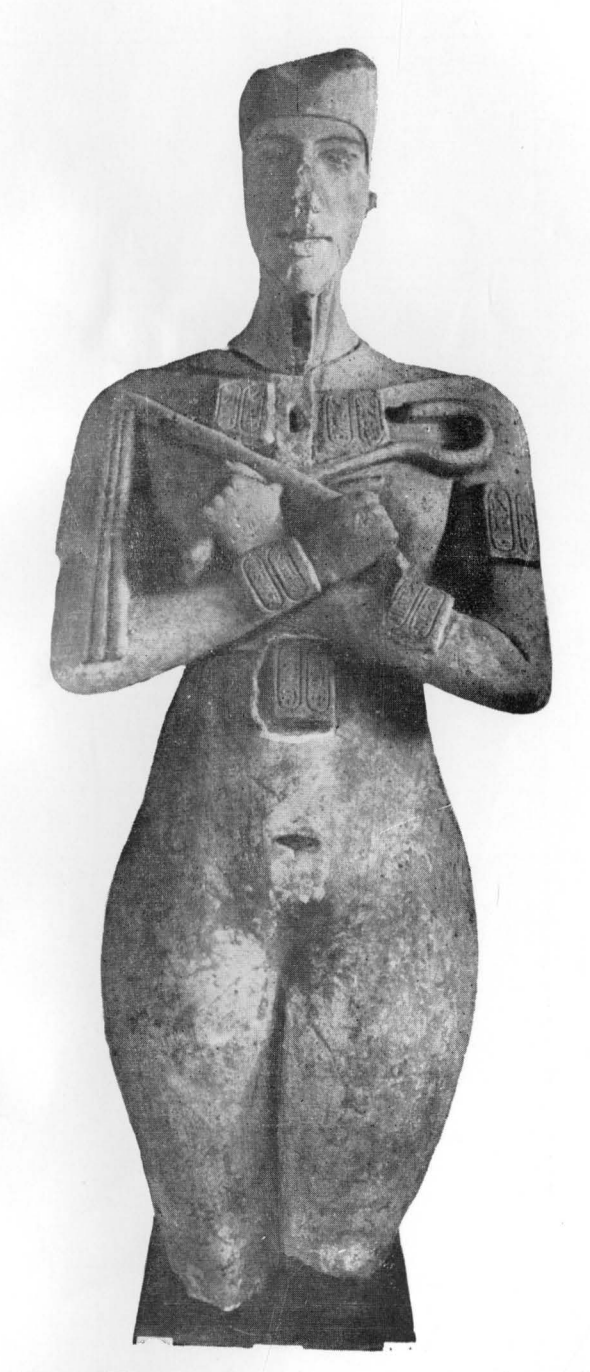
Cairo Entry No. 55938.—The naked and sexless colossal statue of Akhenaten